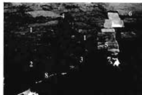
1 - Young capoeira; 2 - Old capoeira; 3 - Stream "Água Branca" and Gallery Forest; 4 - Spring; 5 - Passion fruit; 6 - Manioc; 7 - Farm house; 8 - Road.

Either one of the two suggested alterations, the fire-free land preparation or the enrichment planting, can effectively contribute to the small-holders land use system of the region. However, the positive effect of enrichment plantings with nitrogen fixing leguminous trees and aggressive nutrient re-cycling out of deep soil layers is made up for if the land is