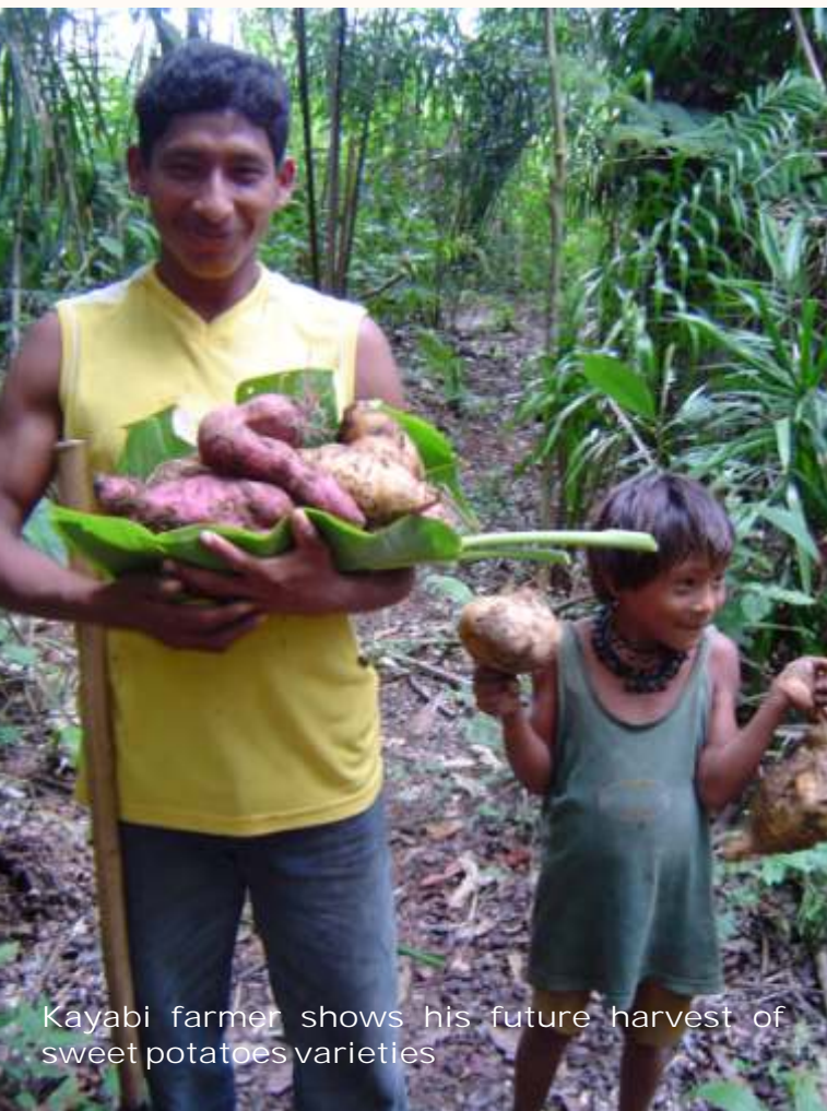
Kayabi farmer shows his future harvest of sweet potatoes varieties

The Brazil-Italy Co-operation Programme on Biodiversity ( Programa Biodiversidade Brasi-Itália, PBBi ) is a bilateral cooperation initiative aimed at the conservation and sustainable use of plant genetic resources of Brazilian native species of interest for food, agricultural and industrial purposes. Scientific and organizational emphasis have been put on in-situ/on-farm approaches and participatory research and development (R&D) together with