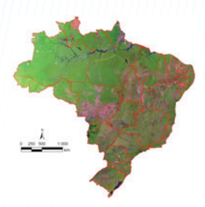
Image composition of Brazil - Landsat images processed by Embrapa Satellite Monitoring.

scale water productivity assessments. They observed natural vegetation and agricultural crops in various agro-ecosystems in Brazil, taking into account both rainfed and irrigation aspects. Importantly, the dual use of remote sensing and weather data allowed them to obtain these large-scale water productivity assessments from different agro-ecosystems: "The analyses may contribute to a better understanding of the biophysical parameter dynamics, which are highly important for appraising the impact of climate and land use changes and for informing government plans to expand the irrigated areas," Teixeira points out.