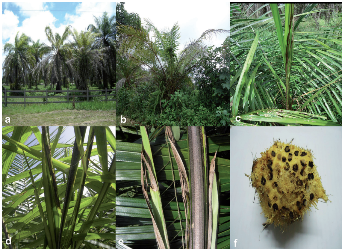
Figure 2. Fatal yellowing (FY) disease in oil palm. (a) Oil palm plantation affected by FY; (b) individual showing signs of yellowing and necrosis of the intermediate leaves; (c, d, e) evolution of yellowing and dryness of the spear leaf with the presence of necrotic tissue, and (f) root section of an individual with signs of rot.

stayed as a small industry until 1960, when, due to increasing demand for oil for cooling steel sheets in the national steel park, it started to experience significant growth [33]. In 1967, the oil palm cultivation expanded to the Pará State, in the North region of Brazil, with the first commercial-scale plantations comprising about 3.000 hectares [32].