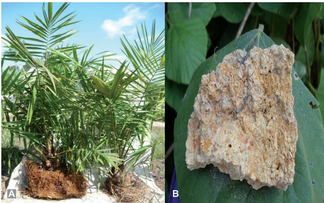
Figure 3. Oil palm plant showing reduction of the root system in hypoxia conditions (A), and soil clouds showing the typical reductimorphic or oximorphic color mottles caused by stagnating soil environment (B).

To gain insights into the idea of oxygen deficiency (hypoxia) in the origin of FY, a study by Encinas [85] evaluate the influence of land use and temporal variations on the dynamics of nutrients in the solution of soil and water at an oil palm plantation and a nearby area still with primary forest. Another by Muniz [83] compared the changes in water flow at an oil palm plantation and a nearby area still with native vegetation cover and evaluated its effects on iron dynamics and the structure of the soil. These two studies gathered additional shreds of evidence to further support this hypothesis, such as the electrical conductivity increased during a long flooding period (95 days), indicating that ions from the aggregates migrate to the solution; the soil pH increases after the initial flooding period, reaching values close to neutrality, with a subsequent reduction, but above the values found in aerated soil; the soil redox potential decreases during the flooding period, forming a highly reducing environment; the total carbon contained in the macroaggregates reduced