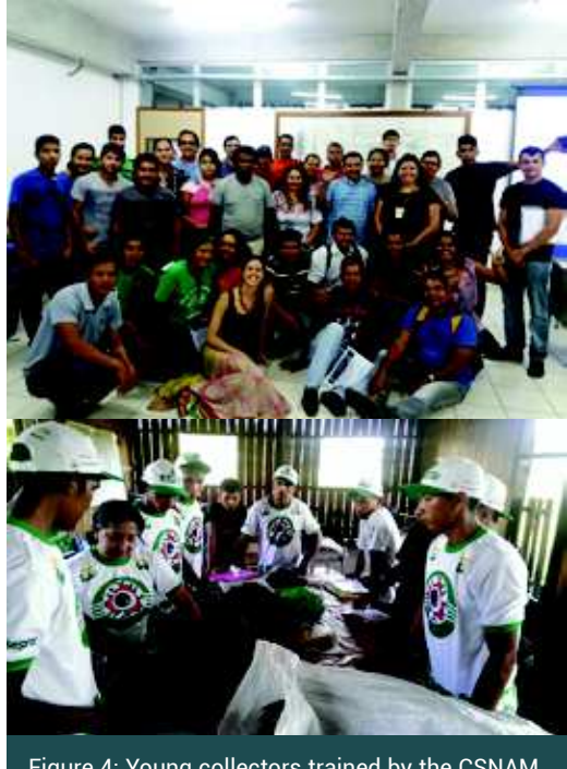
Figure 4: Young collectors trained by the CSNAM, Manaus, Brazil (4A). Preparation of botanical material for identification (4B) course by the CSNAM, Manaus, Brazil.