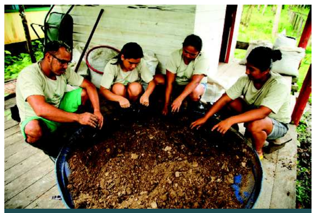
Figure 3: Substrate prepared by young people and local leaders in the nursery of the Arraial do Bailinque, Amapá, Amazon. (Source: Marcia do Carmo).

is a secondary economic activity, carried out by 16 families, along with açaí and agricultural production.