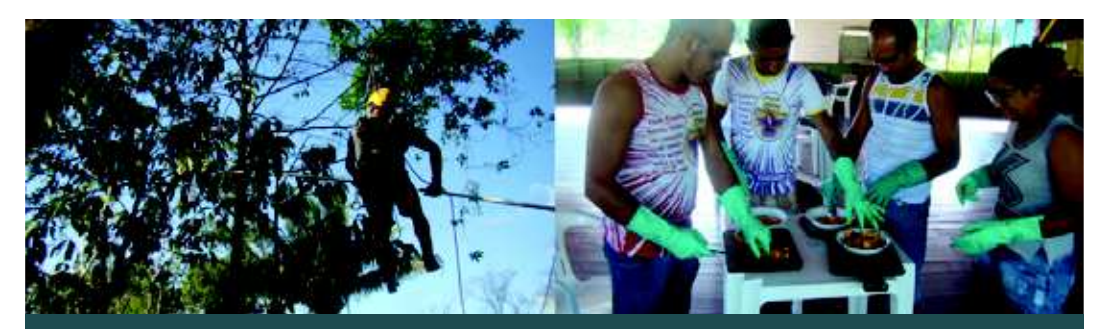
Figure 2: Training activities for seed collection (a) and management of forest seeds (b) carried out in the Arraiol do Bailique community, Amapá, Brazil.