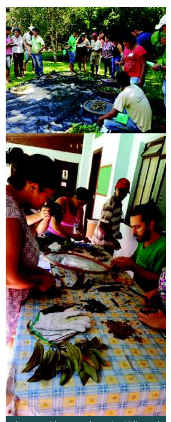
Figure 5: Training Course for seed multipliers and collectors (5A) with production planning practices (5B) and seed handling conducted by the REMAS in support of the Portal Seeds Network, Mato Grosso.