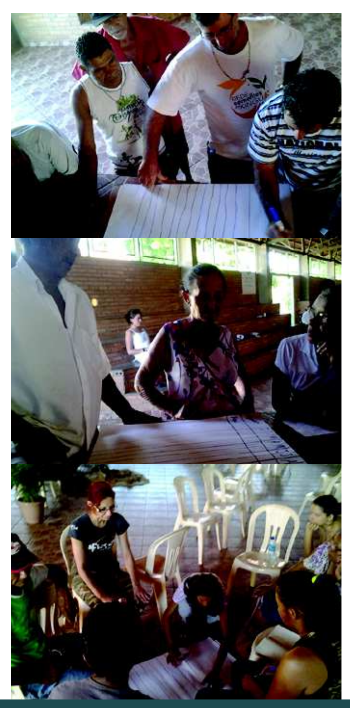
Figures 6: Participatory construction of the harvest schedule (6A and 6B), and comparison and joint construction of the harvest schedules (6C) in training workshops and exchange of knowledge in the Xingu Seed Network, São Felix do Araguaia, Mato Grosso, Brazil.

Forest Landscape Restoration And Social Opportunities In The Tropical World