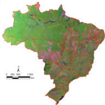
Image composition of Brazil - Landsat images processed by Embrapa Satellite Monitoring.