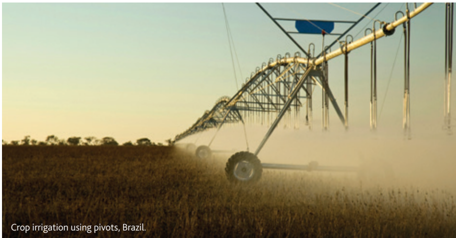
Crop irrigation using pivots, Brazil.

In their study, Teixeira and his colleagues combined the Simple Algorithm For Evapotranspiration Retrieving (SAFER) with the Monteith radiation model to show that satellite measurements coupled with weather data can be effectively used for large-